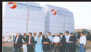
Earthquake Balochistan 2008