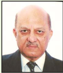
Justice (Retd.) Nasir Aslam Zahid Former Chief Justice, Sindh High Court, Judge Supreme Court of Pakistan