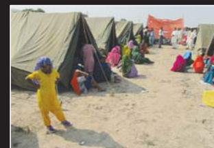
Flood Sindh 2010