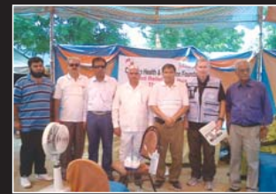
Flood Thatta 2010