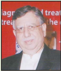
Mr. Shaukat Tarin Former Federal Finance Minister of Pakistan