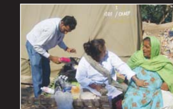
Flood Sindh 2010