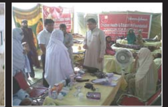
Flood Nowshera (KPK) 2010