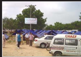
Flood Sindh 2010

Pictorial of Human Relief services for National Disaster, Earthquake 2005, 2008 and Flood 2010