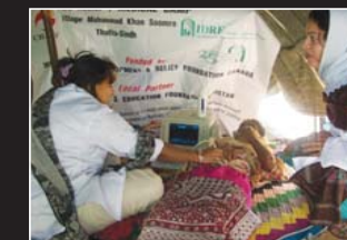
Flood Sindh 2010