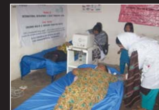
Flood Sindh 2010