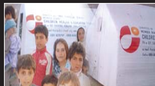
Earthquake Balochistan 2008