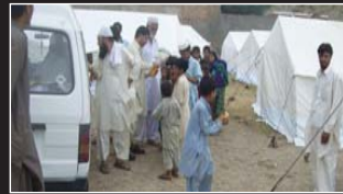
Earthquake Balochistan 2008