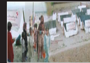
Flood Charsada (KPK) 2010