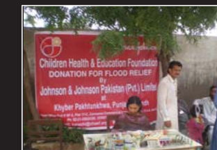
Flood Sindh 2010