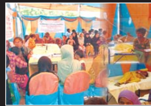
Flood Thatta 2010