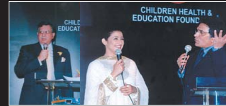
Fund Raising for Earthquake 2005