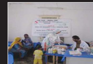
Flood Sindh 2010