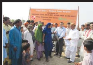
Flood Sindh 2010