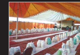
Flood Punjab 2010